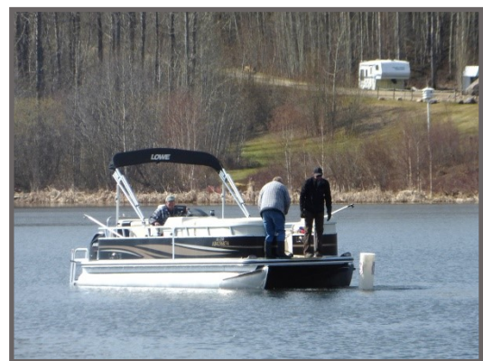
WLWLSA wishes everyone a wonderful, safe summer of water activities on Wizard Lake.

The Leduc County by-law officers will have their boat in the water this summer, and the RCMP will be patrolling, with their boat, to enforce safe boating.