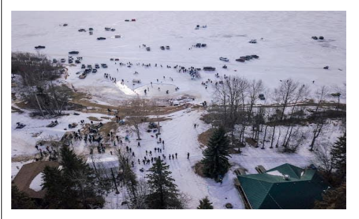
Kick sleds were a hit as were all activities along with the one-man band.

2023 TRY IT EVENT... approx. 700 participants enjoyed the beautiful day at Jubilee Park Day Use area.